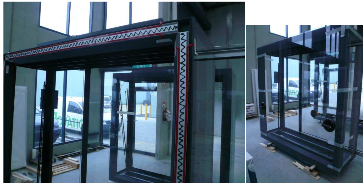
High-Tech-Tape is visible with the red lines.